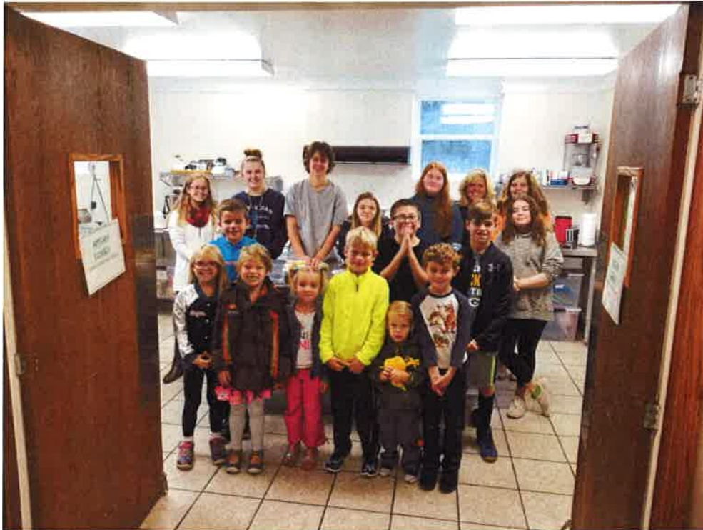
St. John's youth recently hosted a meal to benefit its local vacation bible school. Pictured from the...